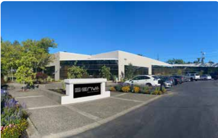
Senva Production Facility - Beaverton, OR