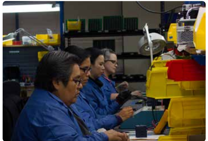
Senva current sensor assembly and testing line